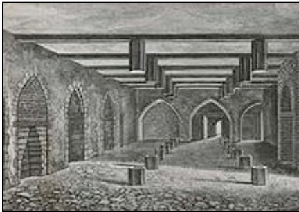
The lower ground floor vault of the House of Lords where the gunpowder was stored

Their first meeting was on 20 May 1604. Catesby was joined by his friends Thomas Wintour, Jack Wright and Thomas Percy at the Duck and Drake, in the Strand. The fifth person was Guy Fawkes. Originally from York, he had been recruited in Flanders, where he had been serving in the Spanish Army. They discussed their plan to blow up Parliament House, and shortly afterwards leased a small house in the heart of Westminster, installing Fawkes as caretaker, under the alias of John Johnson.